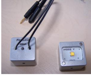
LED module- CUB xxx