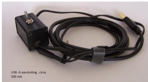
USB -A aansluiting , circa 500 mA