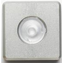
Lens-spot/ wide/ asymmetric