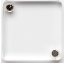
interface 3D .